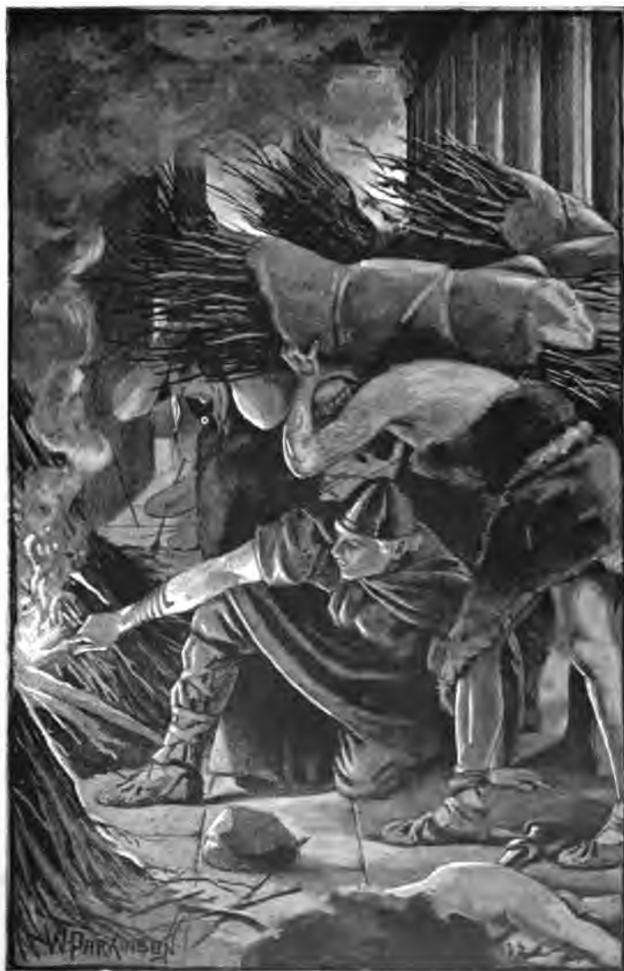
BERIC FIRES THE ROMAN TEMPLE